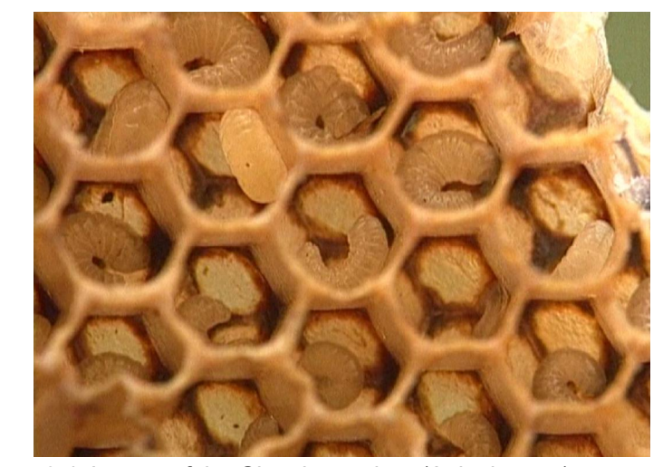
3.4. Larvae of the Giant honey bee (Apis dorsata) breed within their cells of the broodcomb

photos 3.2 to 3.5: Camera stills of the film "Honey Hunters of the Blue Mountains", by Keystone Foundation & Riverbank Studios