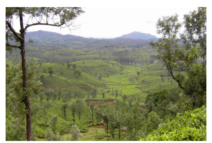
5. The Nilgiri hills are an important tea growing area.