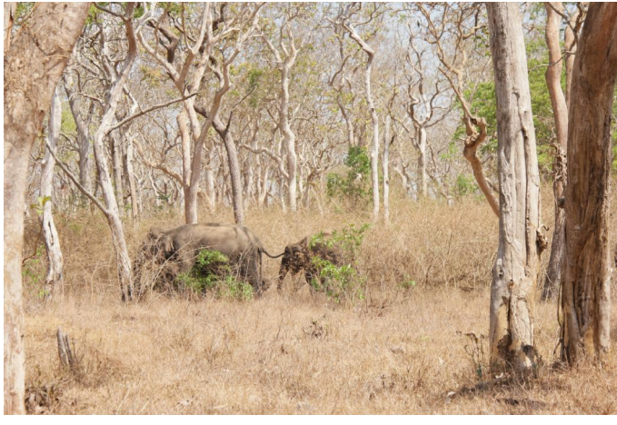
8. The Nilgiri hills are home to 5,200 elephants.