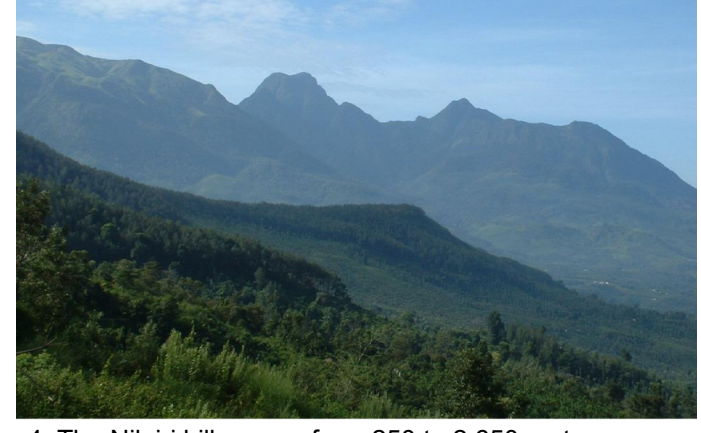
4. The Nilgiri hills range from 250 to 2,650 metres.