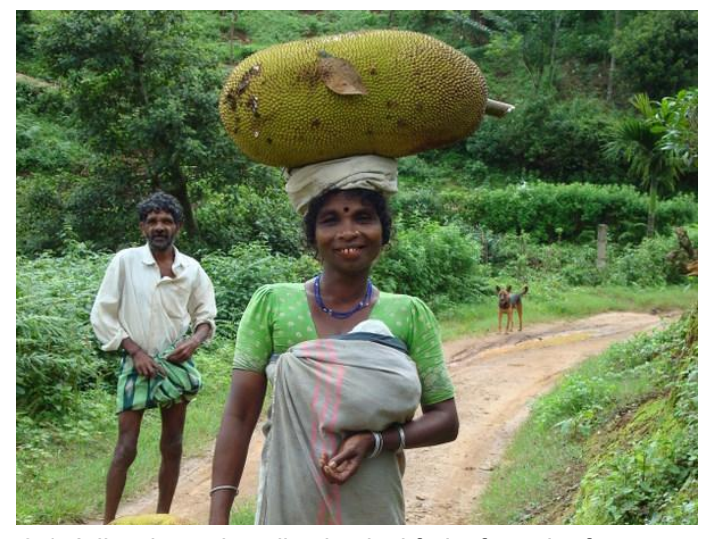
2.4. Adivasi couple collecting jackfruits from the forest