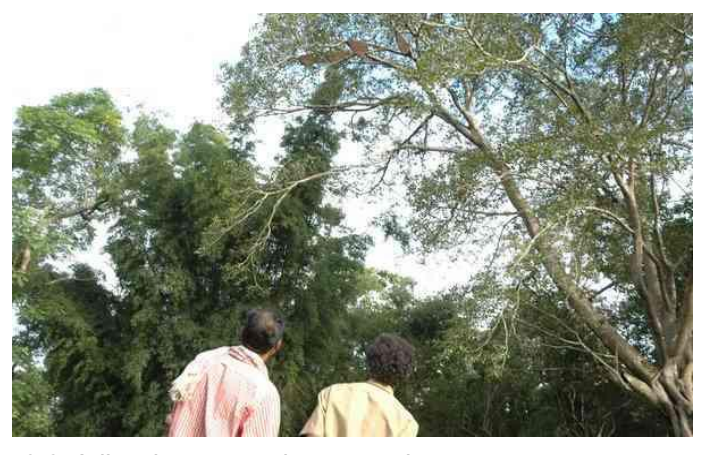
3.6. Adivasi men spot honeycombs on a tree