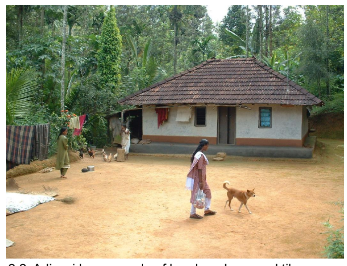
2.2. Adivasi house made of bamboo, loam and tiles