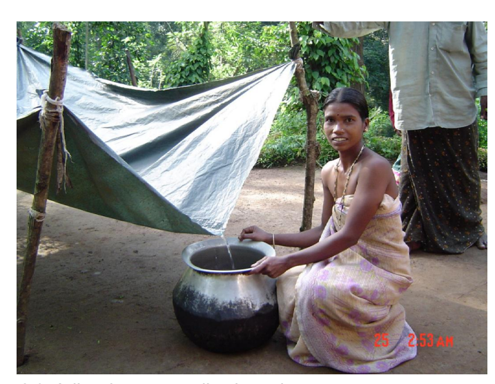
2.3. Adivasi woman collecting rain water