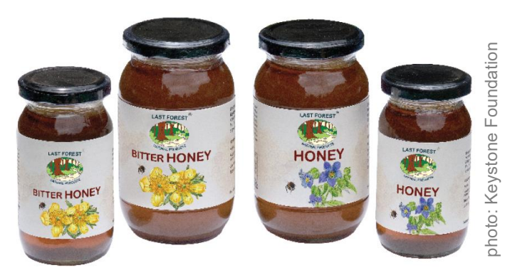
3.9. Honey hunted by the Kurumba adivasis in the Nilgiris

9. Form groups, discuss the following questions and present the results of your group to your classmates: