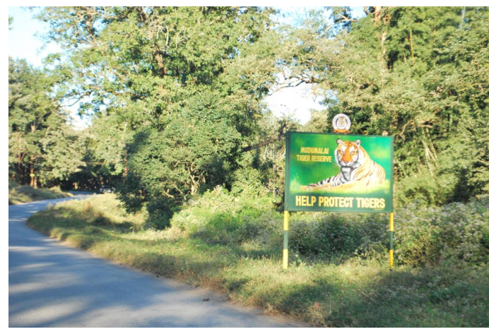
7. The remaining forests are protected for the huge wildlife.