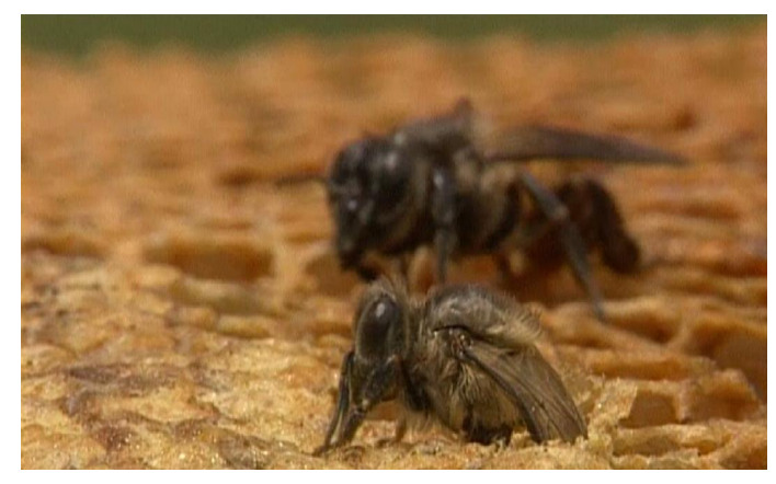
3.5. Adult Giant honey bees (Apis dorsata) emerge from their cells in the broodcomb