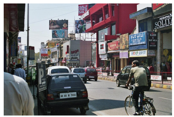
1. You travel to the city of Bangalore (8.5 mill. inhabitants).