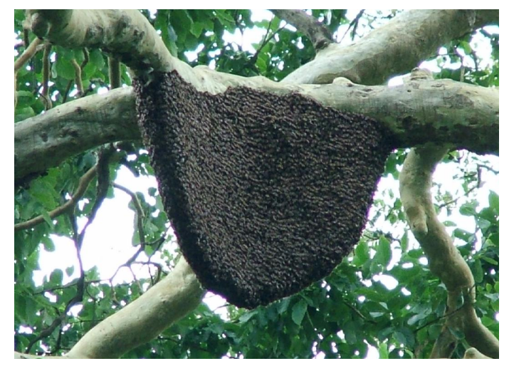
3.1. Comb of the Giant honey bee (Apis dorsata) attached to a tree in the South Indian Nilgiri mountains