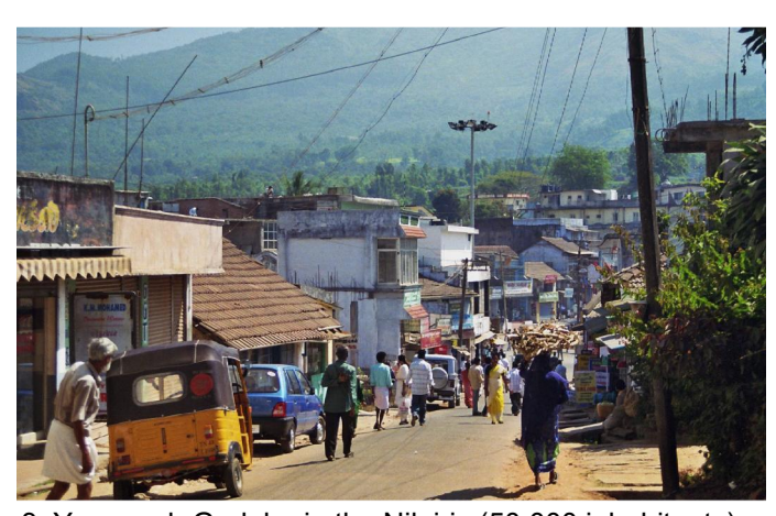
3. You reach Gudalur in the Nilgiris (50,000 inhabitants).