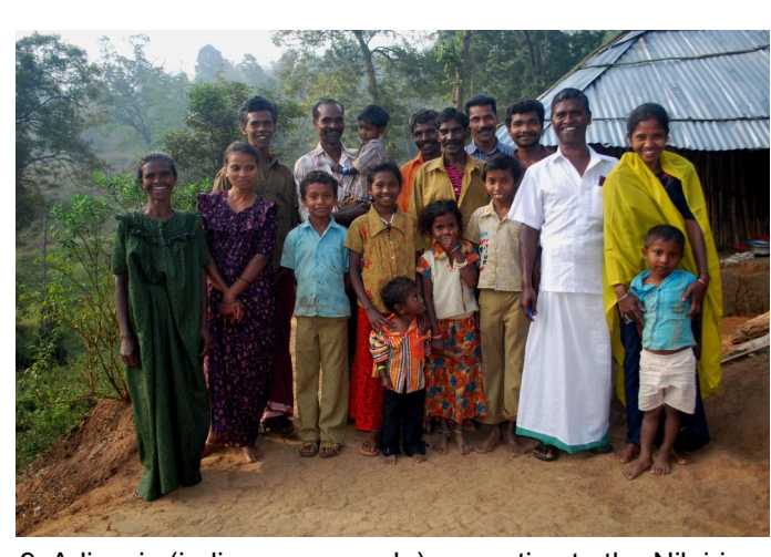
9. Adivasis (indigenous people) are native to the Nilgiris.