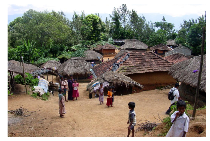
10. Many aspects of their life are linked to the forest.