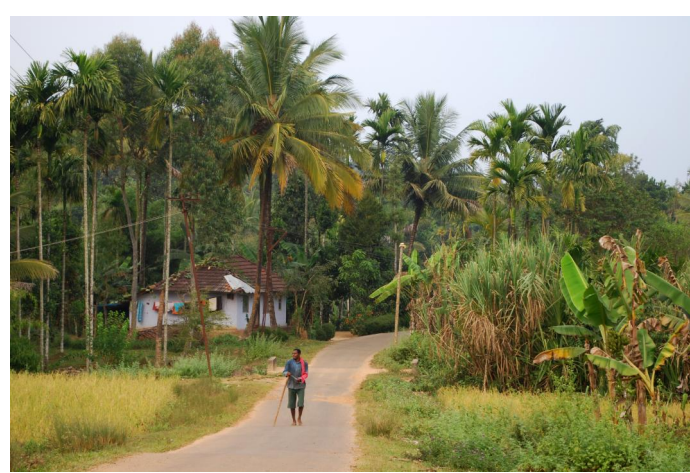
6. In the valleys and villages people sustain themselves through agriculture.