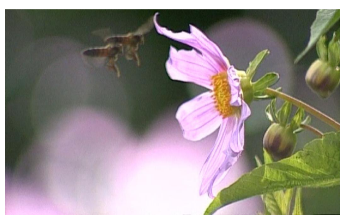
3.3. Giant honey bee (Apis dorsata) pollonate a flower