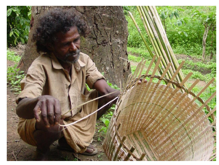
2.5. Adivasi man making a bamboo basket