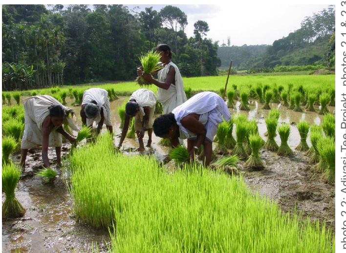
2.6. Adivasi women transplanting rice plants