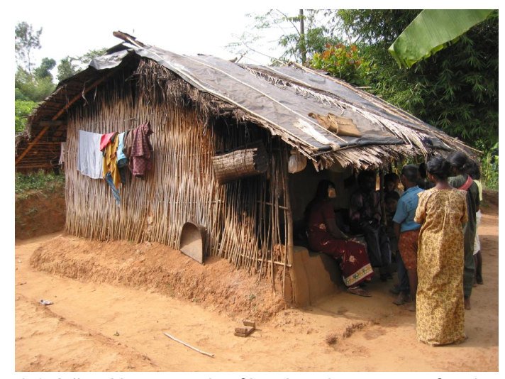
2.1. Adivasi house made of bamboo, loam, grass, frond