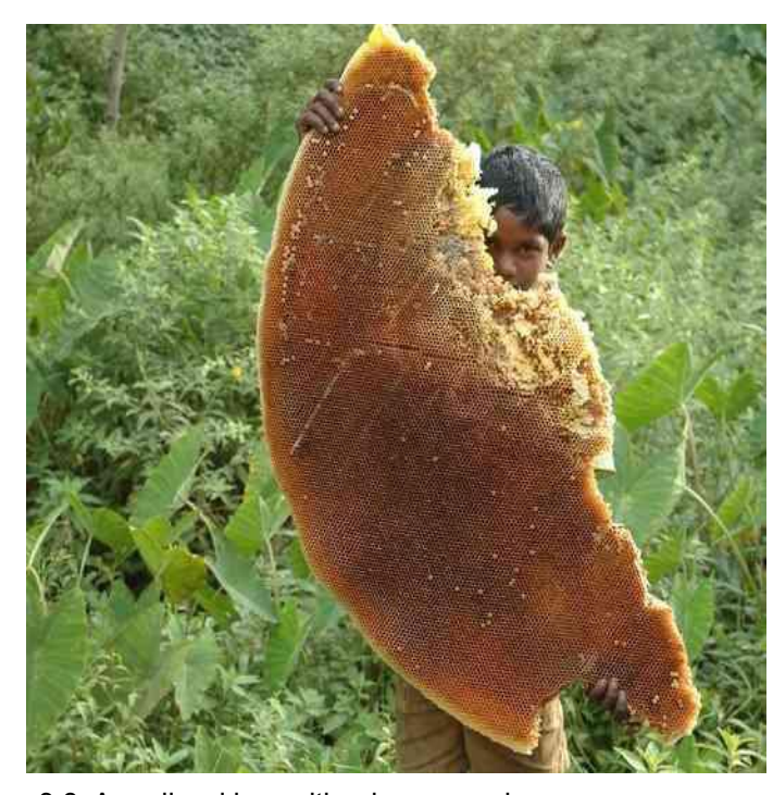
3.8. An adivasi boy with a honeycomb

photos 3.6 to 3.8: Adivasi Munnetra Sangam